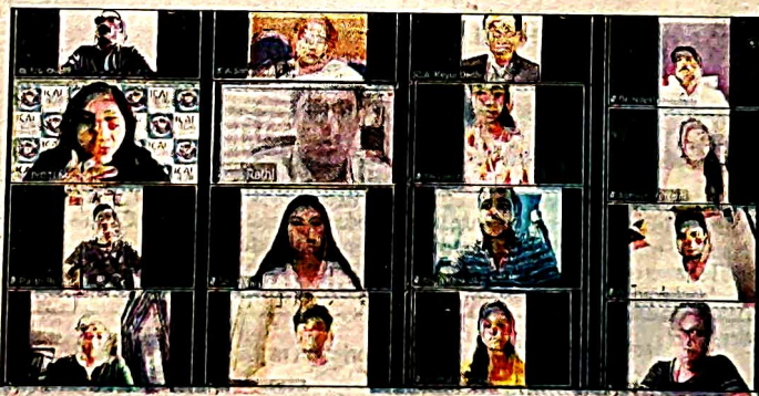
Students and resource persons seen discussing during the event.